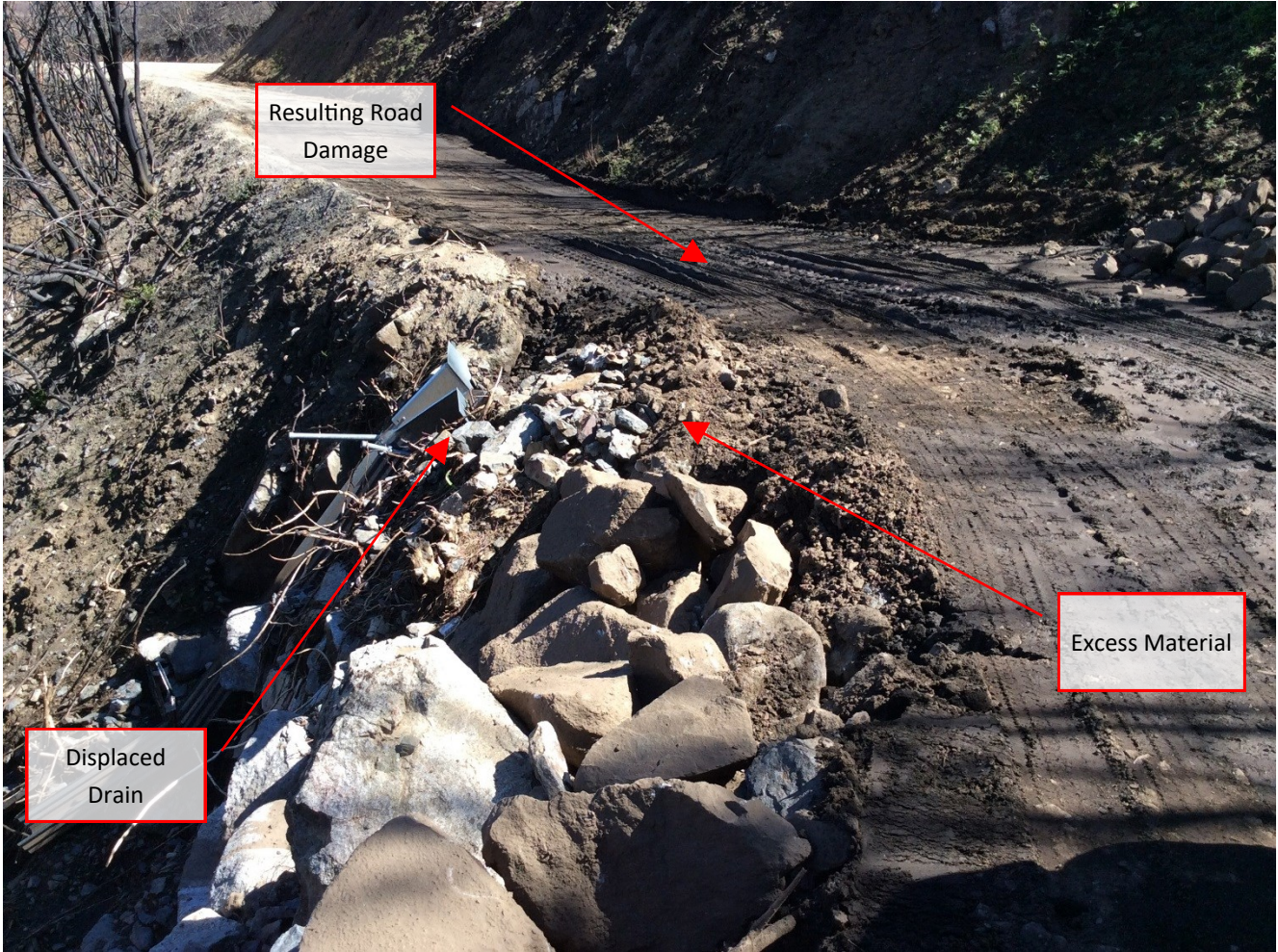
Engineering Project #4: 1N10 Overside Drains with Intercepting Dips