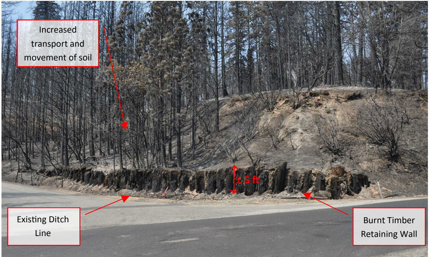
Engineering Project #1: 3N01S Timber Retaining Wall and Ditch