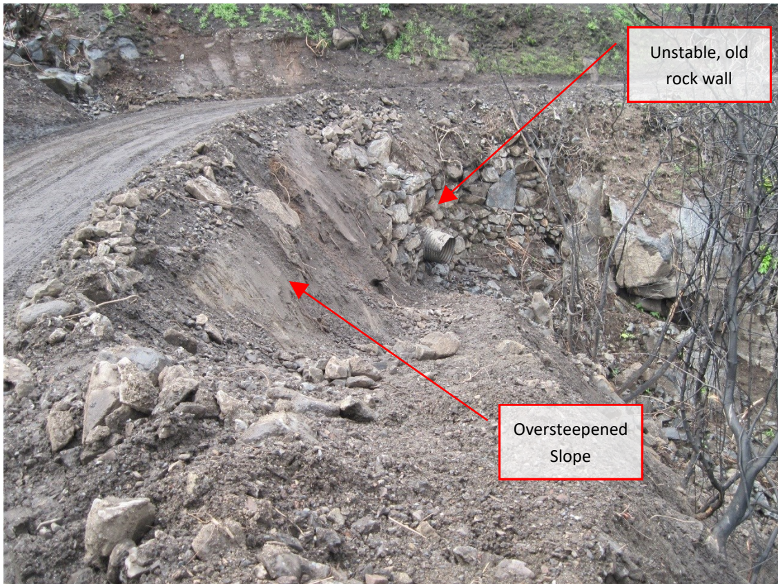
Engineering Project #3: 1N10 Retaining Walls [1 of 2]