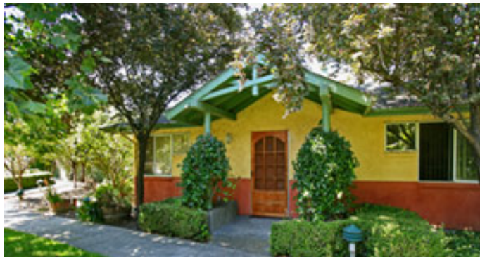
Hendley Circle Apartments – Supportive SRO Housing in Burbank

Many local governments have a record of effective actions to address the homeless needs in their community. SB 2 recognizes and provides flexibility for jurisdictions that have already adopted an ordinance(s) that complies with the new zoning requirements. For those local governments with existing ordinances and zoning consistent with requirements of SB 2, no further action will be required to identify zones available for emergency shelters. The housing element must however, describe how the existing ordinance, policies and standards are consistent with the requirements of SB 2.