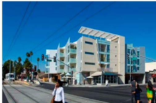
Gish Apartments – Supportive Housing, San Jose, CA

Where a jurisdiction does not provide an analysis demonstrating compliance with the provisions of SB 2 through existing zoning, the element must have a program(s) to address the results of that analysis. For example, if the element does not identify an existing zone to permit emergency shelters without a conditional use permit or other discretionary action, the element must include a program to establish the appropriate zoning, unless the jurisdiction has satisfied its needs through existing emergency shelters or a multi-jurisdictional