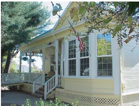
Emergency Shelter – Jackson, California

Requiring a variance, minor use permit, special use permit or any other discretionary process does not constitute a non-discretionary process. However, local governments may apply non-discretionary design review standards.