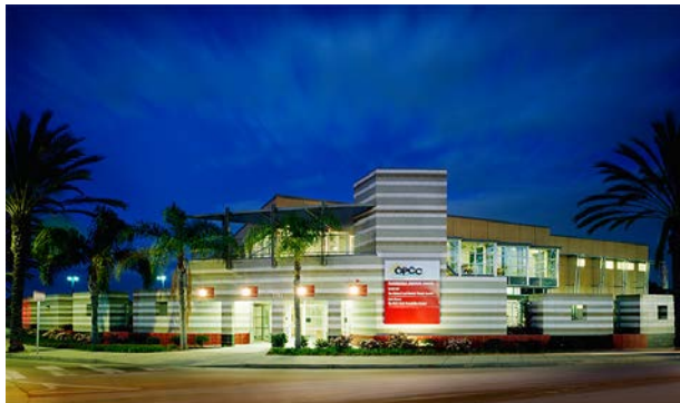
Cloverfield Services Center – Emergency Shelter by OPCC in Santa Monica, CA

Prior to enactment of SB 2, housing element law required local governments to identify zoning to encourage and facilitate the development of emergency shelters. SB 2 strengthened these requirements. Most prominently, housing element law now requires the identification of a zone(s) where emergency shelters are permitted without a conditional use permit or other discretionary action. To address this requirement, a local government may amend an existing zoning district, establish a new zoning district or establish an overlay zone for existing zoning districts. For example, some communities may amend one or more existing commercial zoning districts to allow emergency shelters without discretionary approval. The zone(s) must provide sufficient opportunities for new emergency shelters in the planning period to meet the need identified in the analysis and must in any case accommodate at least one year-round emergency shelter (see more detailed discussion below).