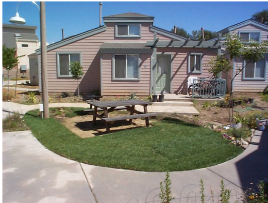
Quinn Cottages, Transitional Housing in Sacramento, CA

If the local government can demonstrate that the multi-jurisdictional agreement can accommodate the jurisdiction's need for emergency shelter, the jurisdiction is authorized to comply with the zoning requirements for emergency shelters by identifying a zone(s) where new emergency shelters are allowed with a conditional use permit.